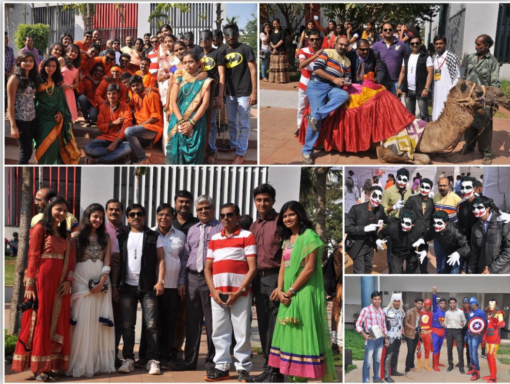
Fun Fair during UTSAV'16