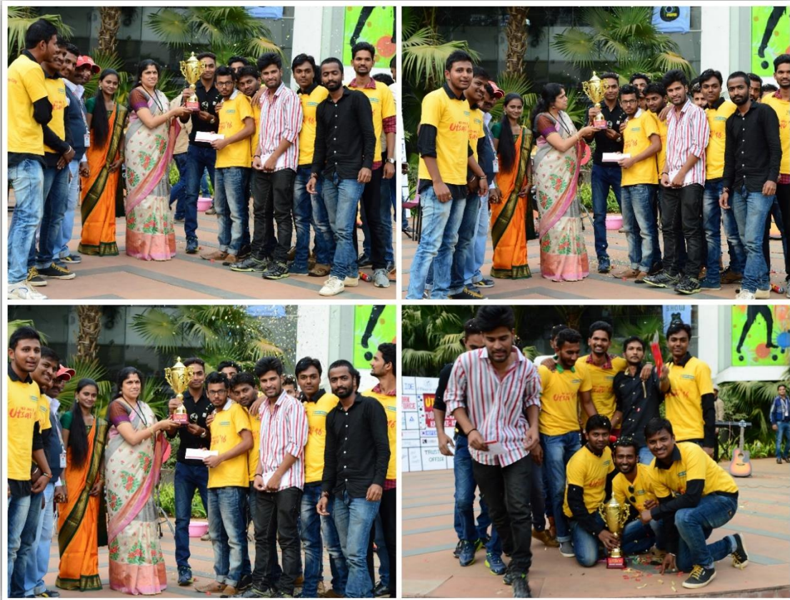
Sports Competition Prize Distribution Ceremony UTSAV 2016