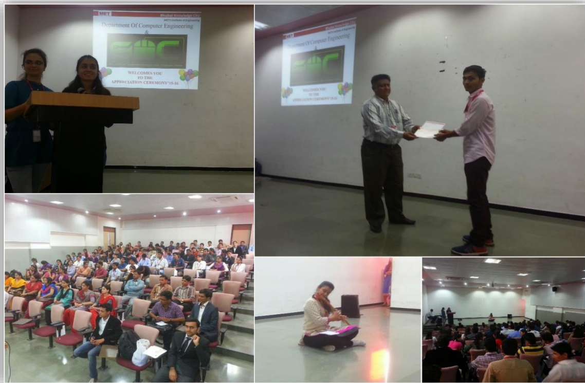
Anchors, Prize Distribution and Student's Performance at Appreciation Ceremony 2016 Prize Distribution by HOD and staff, Alumni Guests Speech