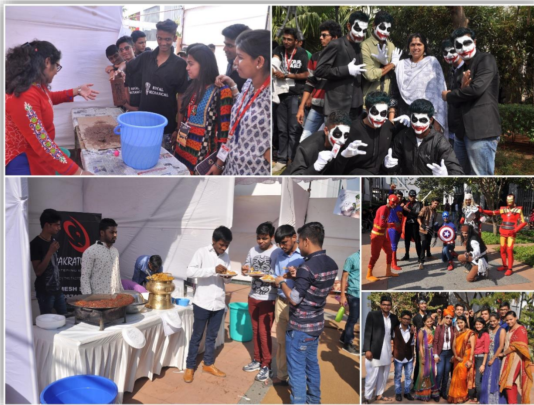
Fun Fair during UTSAV'16

This was mainly the Fair like area where we can enjoy food on various stalls hosted by students of all the departments of all the Institutes of METBKC and also can enjoy various small games which were also hosted on stalls by the students. We had also kept the prizes for winners of games. Almost all the students and staff had enjoyed this event a lot. The event was organized outside IOM and was whole and sole sponsored by Tea Post Nashik.