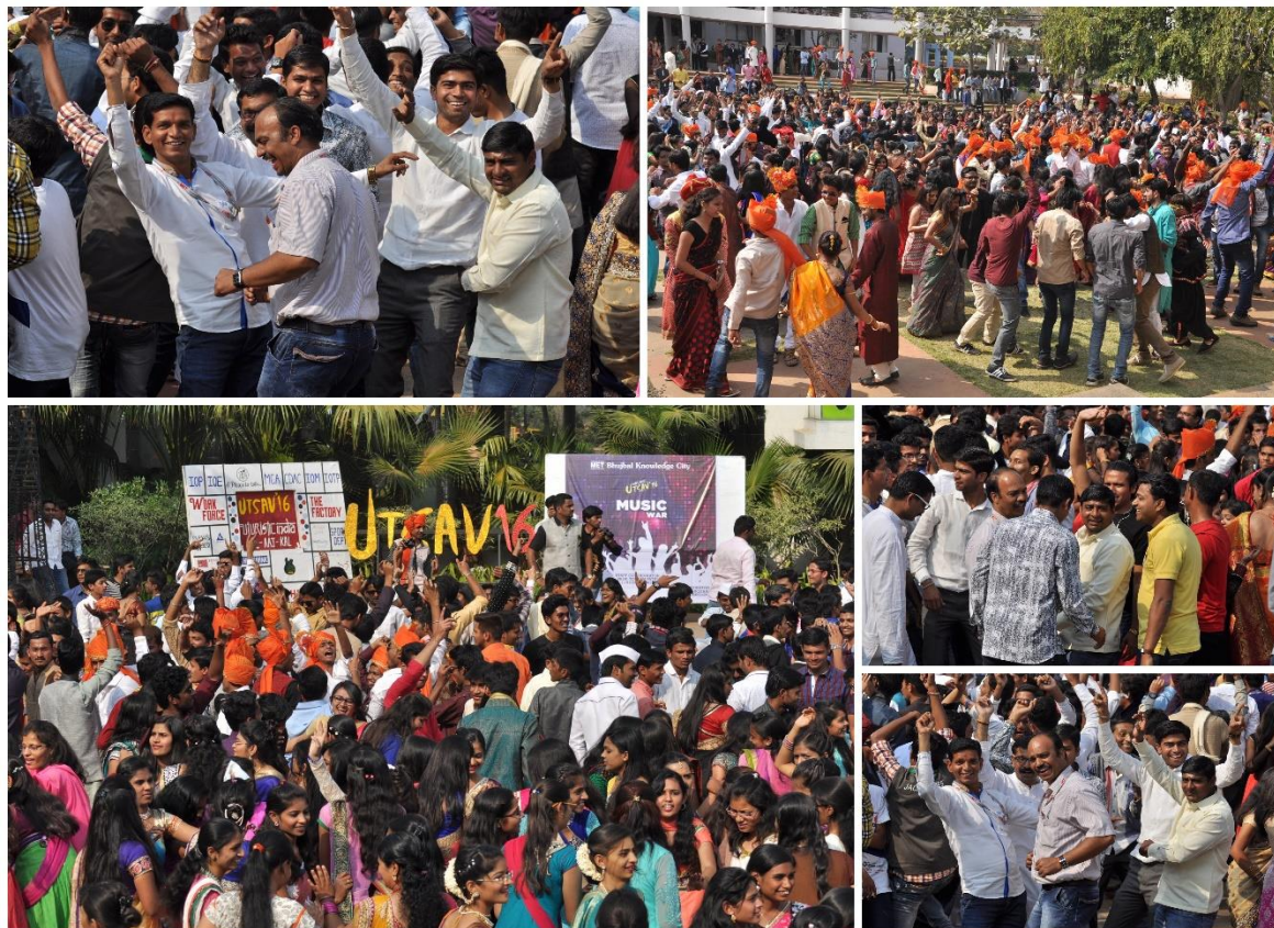
MUSIC WAR during UTSAV'16

A DJ music was arranged for all the audience to have fun with free dance style. This event was very enjoyable and enthusiastic for all the youth of the campus. All the students and staff had actively participated and enjoyed the dance floor to fullest with the charming music at all the time.