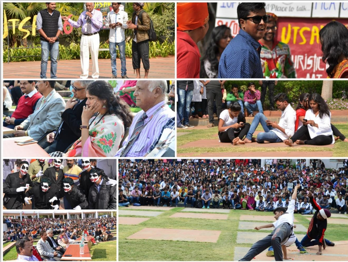
UTSAV'16 Inauguration Ceremony 2016