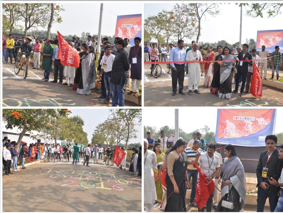
Cyclothon during UTSAV'16

This is again the most beautiful event during UTSAV'16. A cycling competition called "CYCLOTHON" organized to encourage the cycle lover and other people in this today's automotive world. Students and staff from overall campus participated in the event. The event was sponsored by Singh Cycles Nashik who has delivered a grand prize of "Geared Cycle" to the First Winner . It was held on the track behind canteen. A huge response we got from the competition. The main aim of organizing the event was to motivate people to do the best exercise of cycling by avoiding pollution.