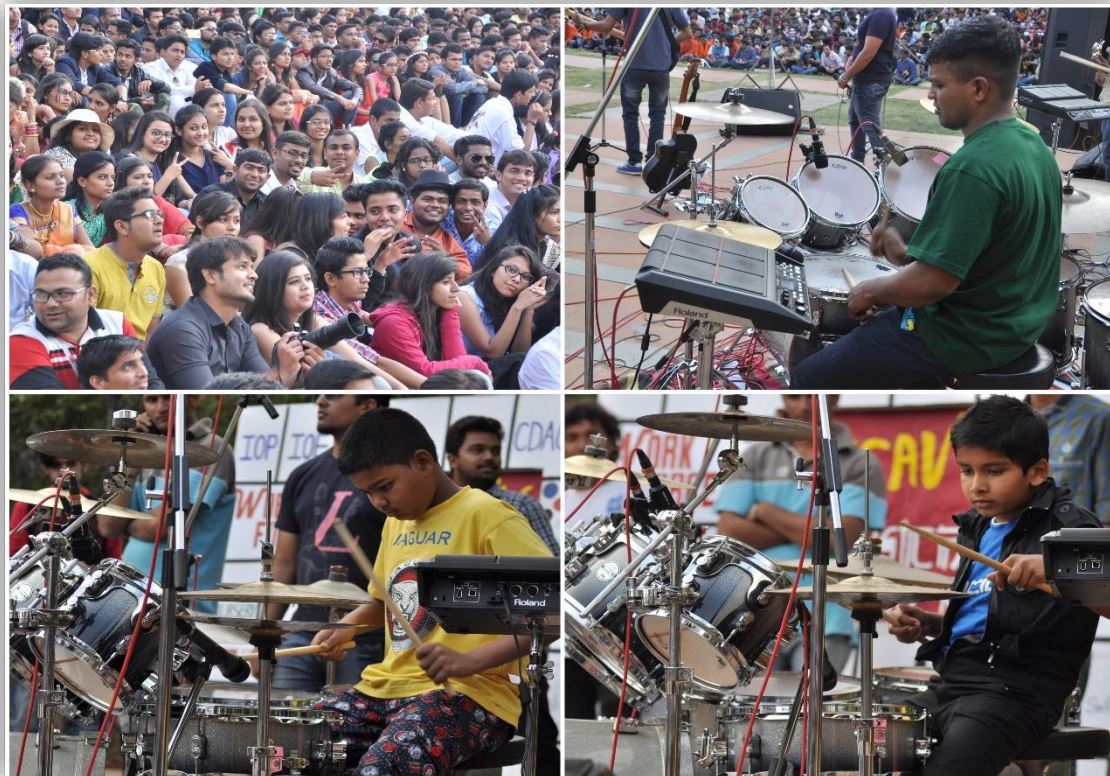
Rock Show during UTSAV'16

It's a "WOW" event for everyone and yes of course one of the talk of the MET shows called ROCK SHOW. Where we use to invite various bands from in and around nashik and provided a platform to showcase their talent and to entertain the people at fullest. Every year UTSAV celebrates youth with ROCK SHOW. This year we invited a local yet amazing band called "MH 15" to perform in front of MET people A huge crowd has witnessed the event with more enthusiasm. One band from IOE also has participated and performed in the ROCK SHOW. This was the in-house activity held at Amphitheater.