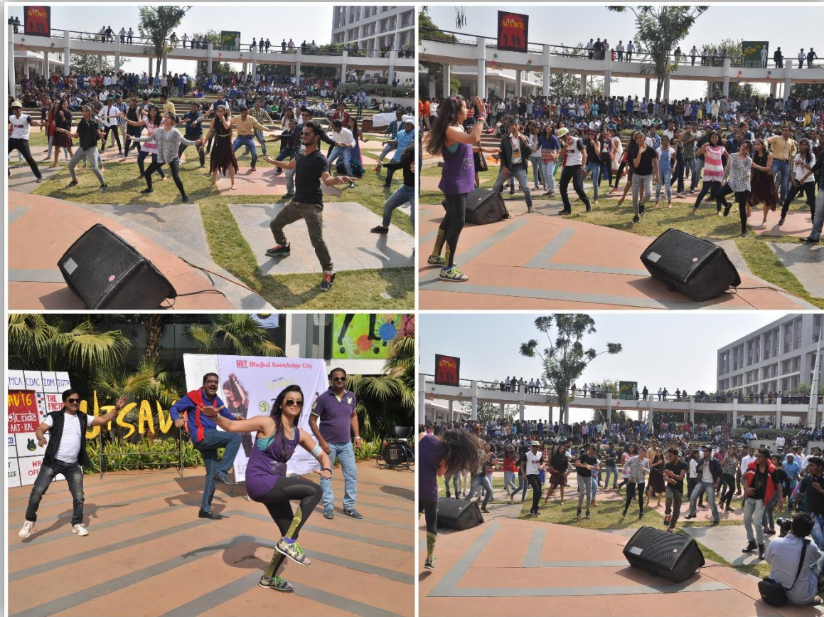
ZUMBA Fitness Dance Workshop during UTSAV'16