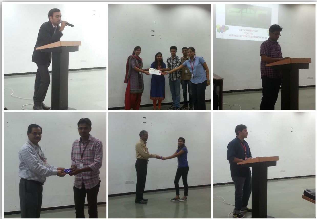
Prize Distribution by HOD & Staff, SAC Student & Staff Speakers on Appreciation Ceremony 2016 at IOE Seminar Hall

Every year SAC organizes various activities throughout the year. In order to motivate to students to develop further in technical and non-technical area, we at Dept. of Computer Engineering and SAC provides the platform to praise them and to give recognition for their devoted work in organizing the various activities. We call it an “Appreciation Ceremony”. This year also we had organized an Appreciation Ceremony for all the students of Computer Engineering. The ceremony was held on 30 th March 2015 . Wherein we praised various students of the SAC committee and other student coordinators who have contributed in various events of the department and given them appreciation certificates, trophies and appreciation letters a token of appreciation towards their valuable work. We ended the ceremony with snacks for all the awardees and hoping for further improved active participation in next year’s departmental and college level events.