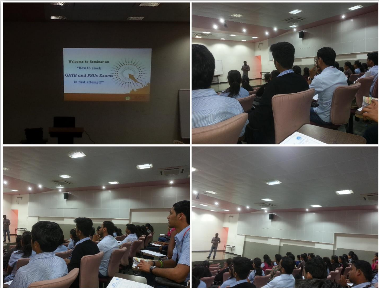
Seminar on "How to crack GATE/IES/PSUs"

SAC had organized a career guidance seminar on “How to crack GATE, IES and PSUs”. This seminar was organized on 15 th Feb 2016 at IOE seminar hall for TE students of Computer and IT. The seminar was conducted by the eminent personnel of ACE Engineering Academy, Pune , which is the top most leading Academy for GATE and the other competitive exam coaching. They addressed students with importance of GATE, IES and PSUs examinations and also gave the ways to crack them well with good marks. They have also told the various area where students can apply and can get plenty of opportunities in various organizations through these examinations. The seminar was wonderful and students got very good opportunity to get the essence of such examinations.