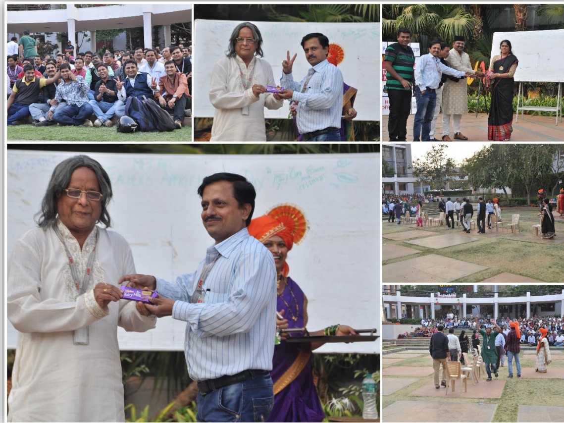
Staff Entertainment Program during UTSAV'16

This is the main event organized by Trust Office Department exclusively for all the Staff of all the Institutes like Engineering , Pharmacy ,Polytechnic , and MBA. This is another soft corner for all the Staff members where on this one day every Staff enjoys themselves by considering only the family member of MET BKC and not teacher. So we can say its grand platform for all the teachers to enjoy and also to showcase their hidden and extracurricular talents. It was organized in AMPHI THEATRE