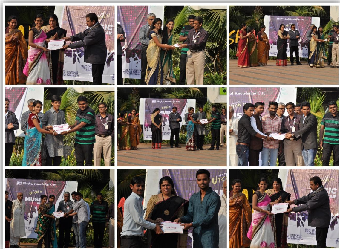
Technofest during UTSAV'16

This event is organized every year by Dept. of ENTC Engg. It is basically for the technocrats who showcase their talent by exhibiting their technical projects and participate in the competition. Students from all over the campus participated and showcased their talent and tested their technical skills.